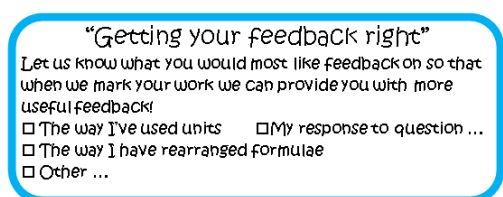
Figure 2: Example of initial 'Feedback Request Label'

The feedback request label is a printed label instructing the students to select the area of their work they would like feedback on, for example, their written response to a question, the way equations are rearranged, the conversion of units etc. If the students would like feedback on an area that is not listed they can select the 'other' option on the label and state the required area of feedback. The options provided on the label were selected by the staff involved in the project based on their own previous experience of marking class tests and also their experience of moderating the work of other colleagues in the subject team. It was found that the feedback given to students on the scripts often fell into one of the three options provided. It was assumed however that the 'other' option could be the most useful to staff; allowing an insight into the areas where students were most concerned, and most wanted feedback. An example of a feedback label is shown in Figure 2 below.