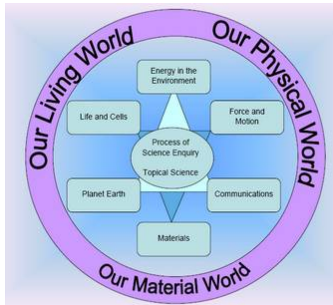
Fig 2: Science Wheel Diagram

The Scottish Qualifications Authority (SQA) is the statutory body responsible for all school qualifications. There is a mismatch between the approaches to learning developed by the school qualifications system and the expectations of university staff; in